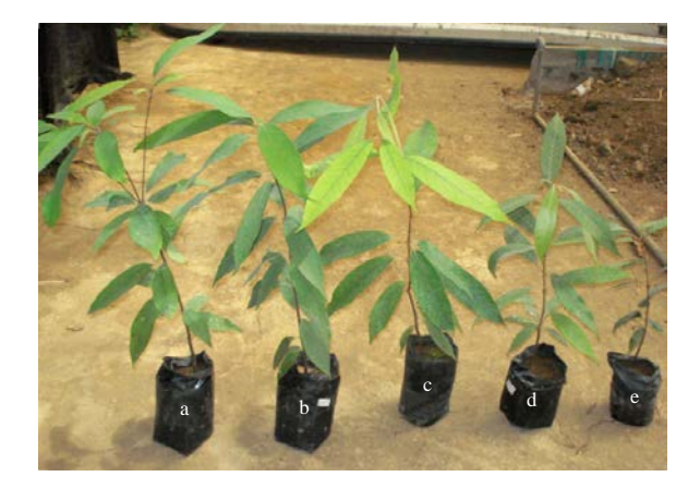
Fig. 2: Lithocarpus urceolaris seedlings inoculated with three species of Scleroderma , a: Scleroderma citrinum , b-c: Scleroderma columnare , d: Scleroderma sinnamariense and e: Control